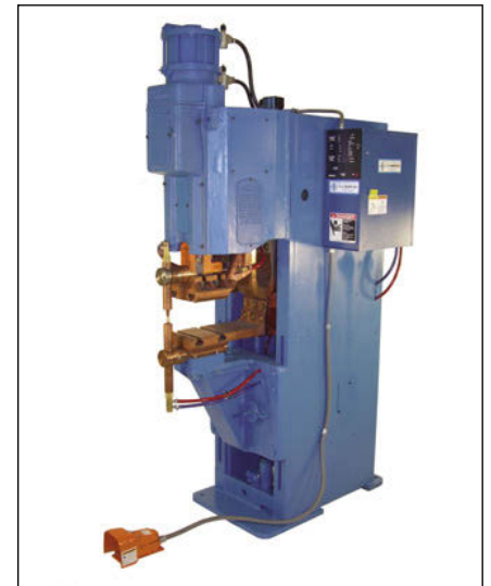
Fig. 2 — The same press-type welding machine after being stripped and rebuilt to like-new specifications, including the installation of a new control with programmable functions.

needed or go through the process to completely strip and rebuild the machine.