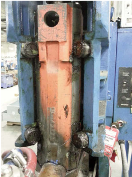
Fig. 3 — A press-type resistance welding machine ram that needs to be repaired.

decades if not abused. Abuse includes overheating due to excessive duty cycle operation, lack of adequate water flow, and internal water saturation due to water leaks or condensation.