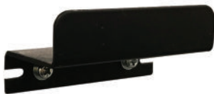
DEP Hanger Bracket Kit 830-1250