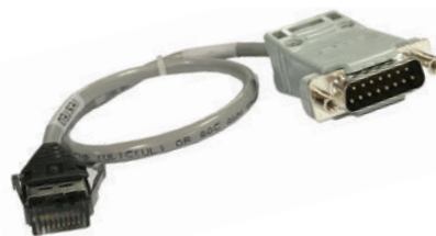
DB15 to SDL Adapter Cable for legacy products 205-3607