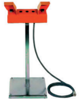
Dual Palm Button Stand